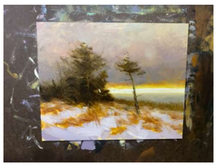
Paul Batch gave an online demo in September