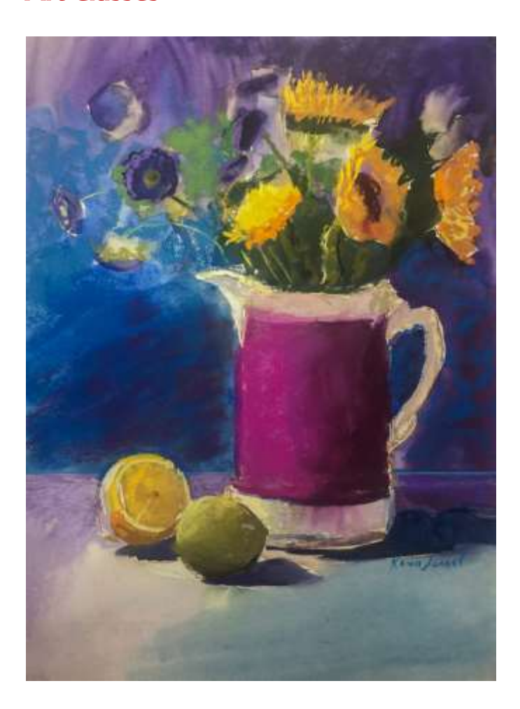
Karen Israel is teaching a Zoom pastel workshop "The Painterly Floral," Dec. 5 and 6, 9:30am - 4pm, <a href="https://www.pastelsocietynh.com/k-israel-2-dayworkshop">https://www.pastelsocietynh.com/k-israel-2-dayworkshop</a>